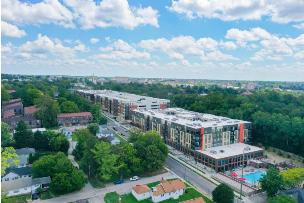
The Standard at Bloomington