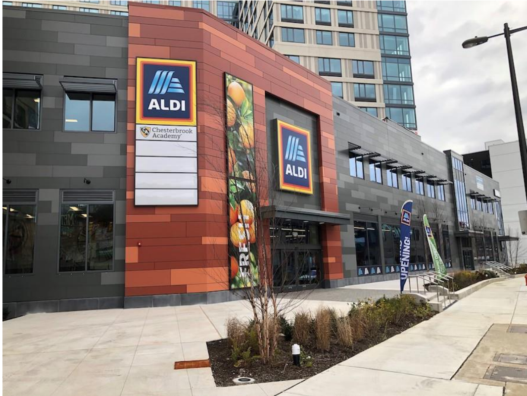
The Aldi storefront on Ridge Avenue

Levine describes this Aldi as a “flagship” for the discount supermarket chain, and the term actually fits, though Aldi itself demurs. Aldi took a lease on 26,000 square feet of space, far larger than the typical Aldi store. More than 15,000 of those square feet are devoted to the actual selling area, about one-third more space than the other Aldi stores in the Philadelphia area.