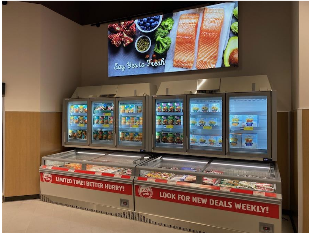
A new style of freezer case resembles a kitchen cabinet*

usually the most colorful part of the supermarket, this should stimulate both shoppers' appetites and store sales. (Levine says the store offers about 40 percent more produce and perishables than the typical Aldi store.)