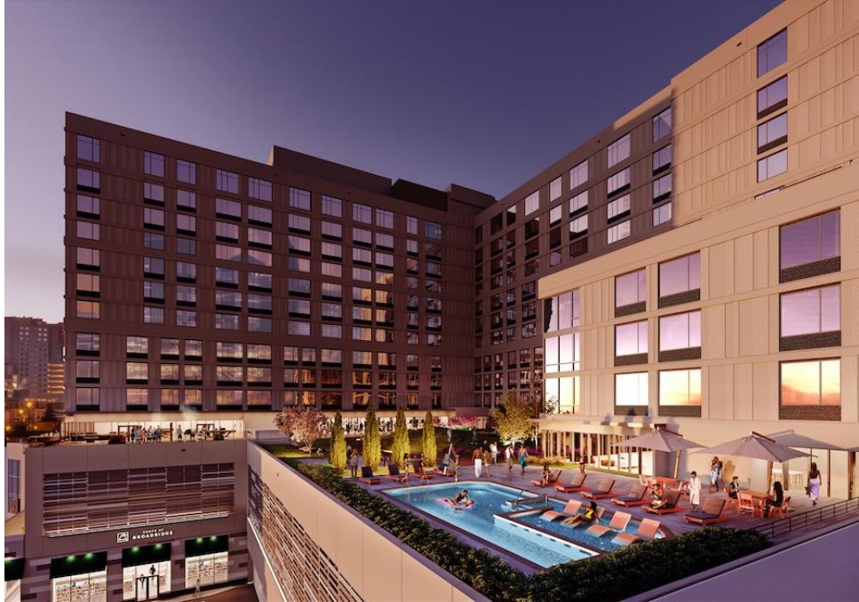
Rendering of roof deck, pool side

The apartment building will have about an acre of outdoor space available on top of the podium, enough room for a pool, grills, planting beds where residents can cultivate their own gardens, a dog run, an outdoor yoga lawn and more. Facing this space will be a large gym, a resident lounge with a fireplace, a library, and co-working space designed to support a work-from-home lifestyle.