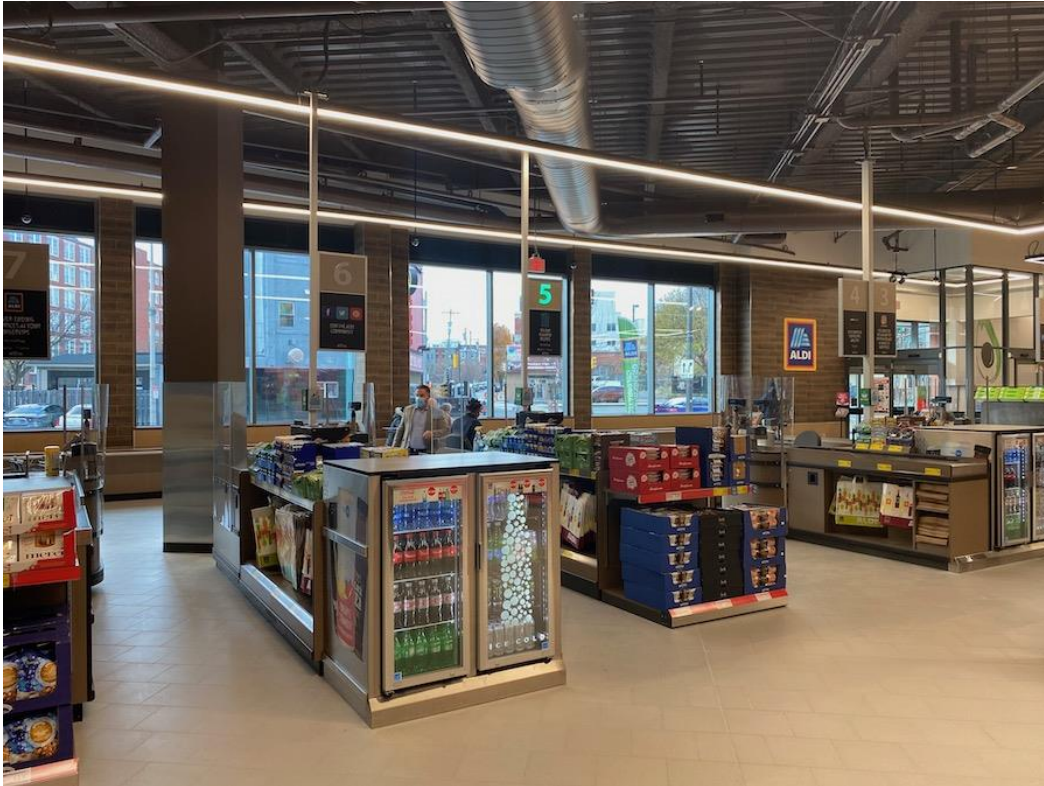
The store's seven checkout aisles, also the most in any local Aldi, are paired with more space in between them. A Coca-Cola display fridge anchors one lane*