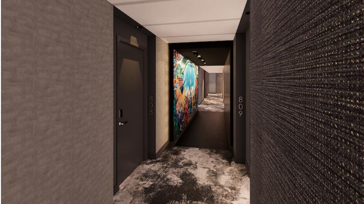
Rendering of interior hallway; RAL reached out to local artists to produce murals and other artwork to add color and life to the hallways

The regular apartments will have in-unit laundry facilities, but all residents will also have access to the communal laundry room on the fourth floor. Levine explains that even the residents with in-unit laundries often find that they have items that are larger than their own washers and dryers can handle, and the community laundry rooms will have machines that can handle them.