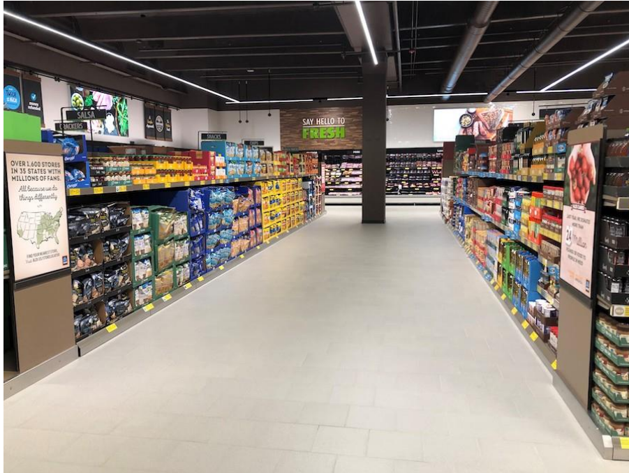
One of the aisles in the new store

What Aldi did with the extra space was open up the store. The aisles in this store are the widest of any Aldi store in the region, and wider than the aisles at most regular supermarkets as well. They also added extra aisles: six in all, which means you will find a larger selection of products in this store than in other area Aldis.