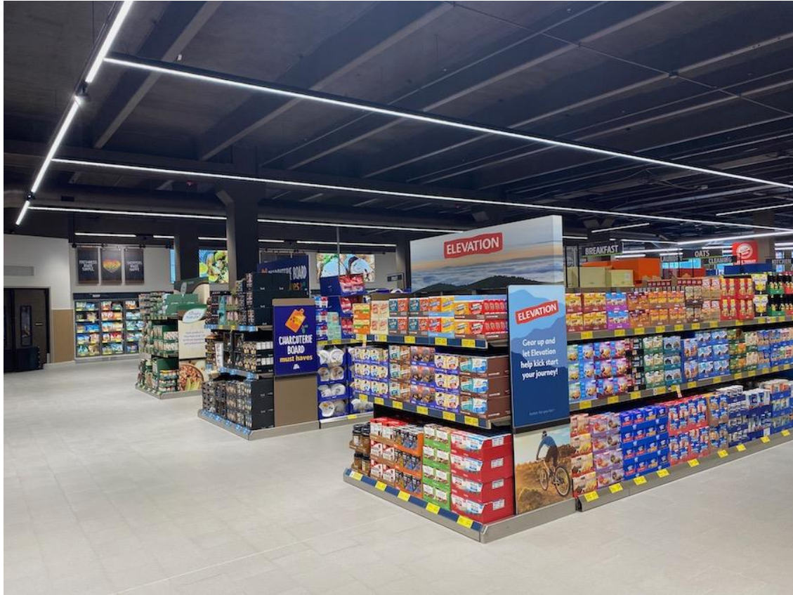
Current aisle end caps feature energy bars and charcuterie-board items*

Because this Aldi is larger, shoppers will find more specialty items in it. Aldi fans know, but the general public may not, that Aldi stores actually carry a wide variety of specialty foods, including cheeses, charcuterie, European chocolates, pastries, breads and crackers.