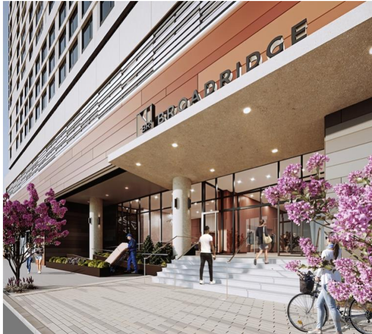
Rendering of main apartment building entrance at 1300 Fairmount Ave.

“The second thing was, everybody wanted a supermarket. So we actually designed the building around a retail podium that had a big enough footprint to accommodate a modern-day supermarket that would provide fresh, affordable foods to the neighborhood.” (That’s how Aldi defines its mission.)