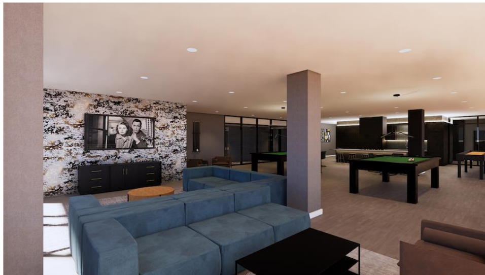
Rendering of main resident lounge on fourth floor

The apartment building will have about an acre of outdoor space available on top of the podium, enough room for a pool, grills, planting beds where residents can cultivate their own gardens, a dog run, an outdoor yoga lawn and more. Facing this space will be a large gym, a resident lounge with a fireplace, a library, and co-working space designed to support a work-from-home lifestyle.