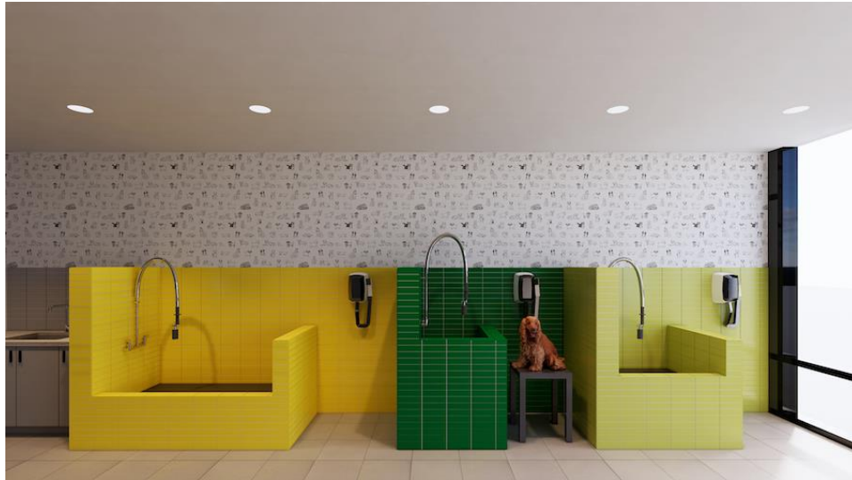
Rendering of dog spa

everyone has a podcast, or they're in a band, or they're looking to do voiceover work. And we thought that was an interesting thing to try to provide in the amenities.”