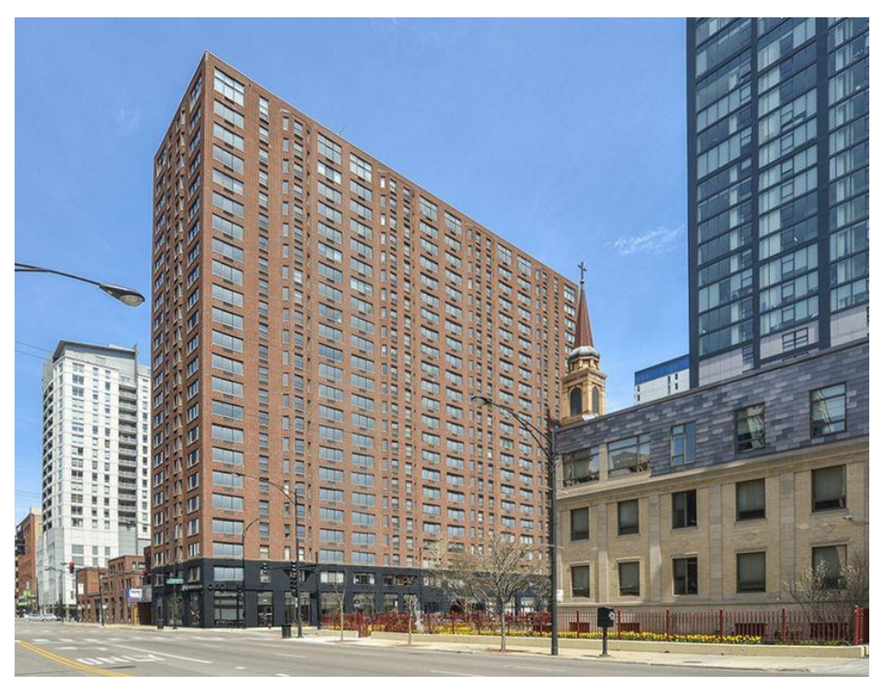
River North Park's amenity package includes two redesigned community lounges, one with a demonstration kitchen and one with a library and co-working stations.

A welcoming, light-filled lobby is dressed in soft gray tones with golden accents and furnished with multiple seating areas and a fireplace. An attendant is on duty at the reception desk 24 hours. Within the corridors are the community laundry, mail room, valet dry cleaning and package service. In addition to the roof deck lounge, the amenity package includes two redesigned community lounges, one with a demonstration kitchen and one with a library and co-working stations. The 24-hour fitness center was overhauled with new spaces and new equipment for cardio- and strength-training, yoga, cycling, locker rooms with showers, and more. Wi-Fi is complimentary in common areas.