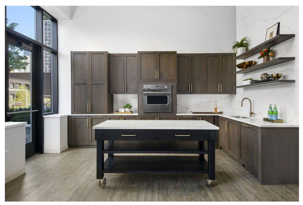
The clubhouse lounge features a full kitchen and collaboration area outfitted with vinyl plank flooring, modern furnishings and seating.

Apartments were upgraded with vinyl woodgrain flooring, stainless steel appliances, solid surface countertops, and either raised-panel maple or Eurostyle matte gray cabinets. Bathrooms sport new vanities, mirrors, floors and lighting. The units also come with roller shades and closet organizers. Bay windows are per plan.