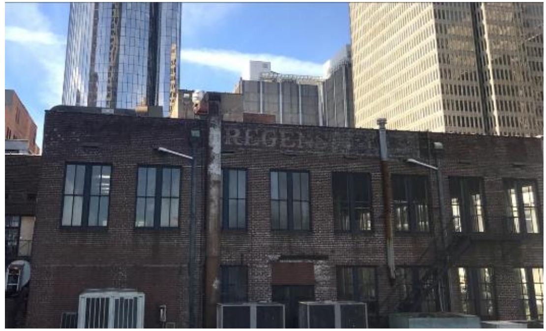
Regenstein's closed in the 1970s. It's remained largely vacant for decades.

Marx Realty hasn't done anything significant to building since then. It may have continued sitting on the property, but something changed two years ago. Post Properties announced it would break ground on its first downtown apartment building in almost 50 years.