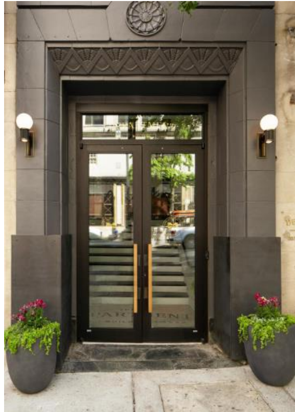
The nearly 100-year-old building was once known as Regenstein's, a women's fashion emporium that joined dozens of other stores and shops on Peachtree Street.